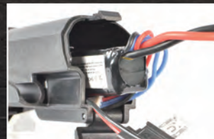
Enlarged battery compartment

The PDW stock adapts the metal adapter to ensure the maximum strength. The stock is made of top industrial polymer for lightweight and durability. Adjustable 3-position fast draw deployment stock. Enlarged battery compartment design stock tube, available for 3-cell Li-Po battery.